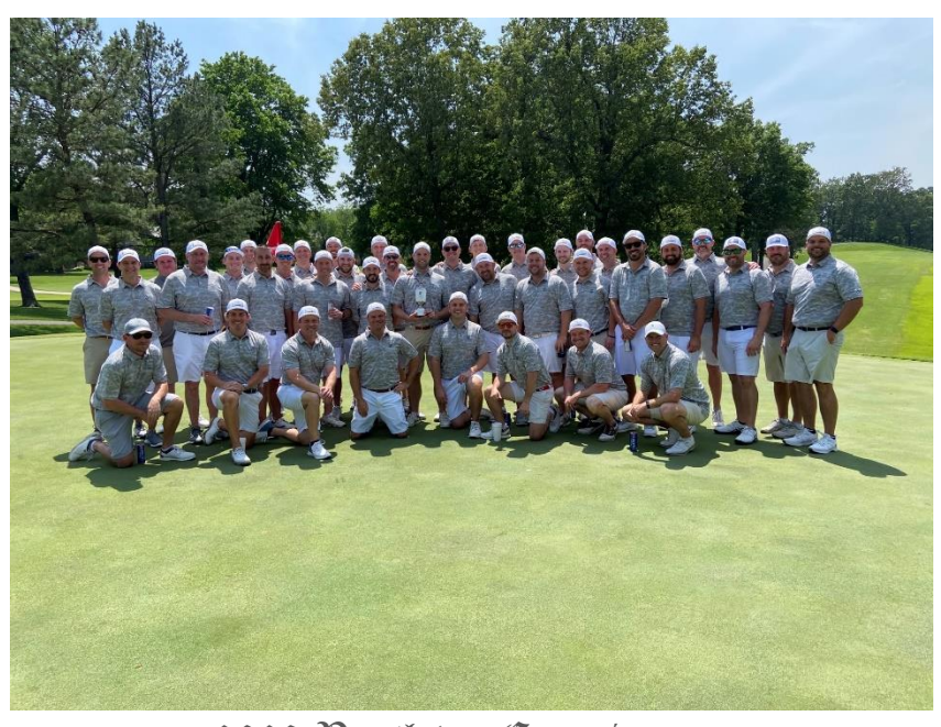
2023 Youth vs. Experience Champions - Team Youth