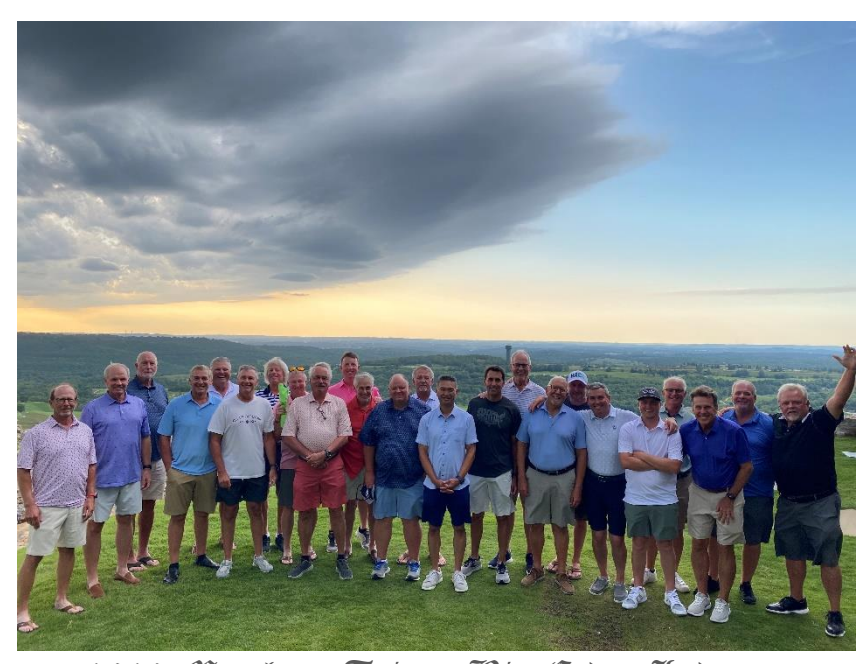
2023 Alembers Trip to Big Cedar Lodge

The list of events that will be worth points along with information of how points are broken down will be posted in the Golf Shop.